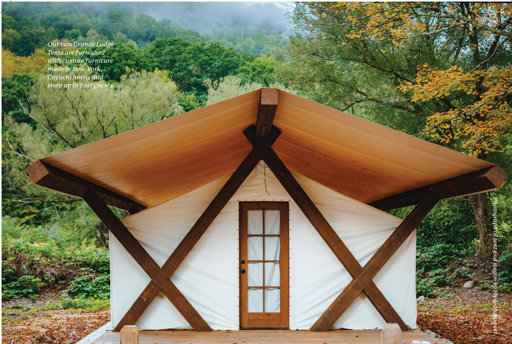
Our two Grande Lodge Tents are furnished with custom furniture made in New York, Coyuchi linens and sleep up to four guests.